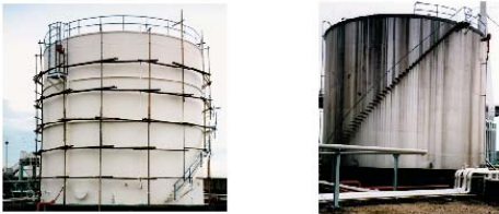
Inside Temp.: 27.0 °C (Standard Temp.: 34.0 °C) Inside Temp.: 22.0 °C

Company K, Osaka North Bay Terminal Date June, 1998